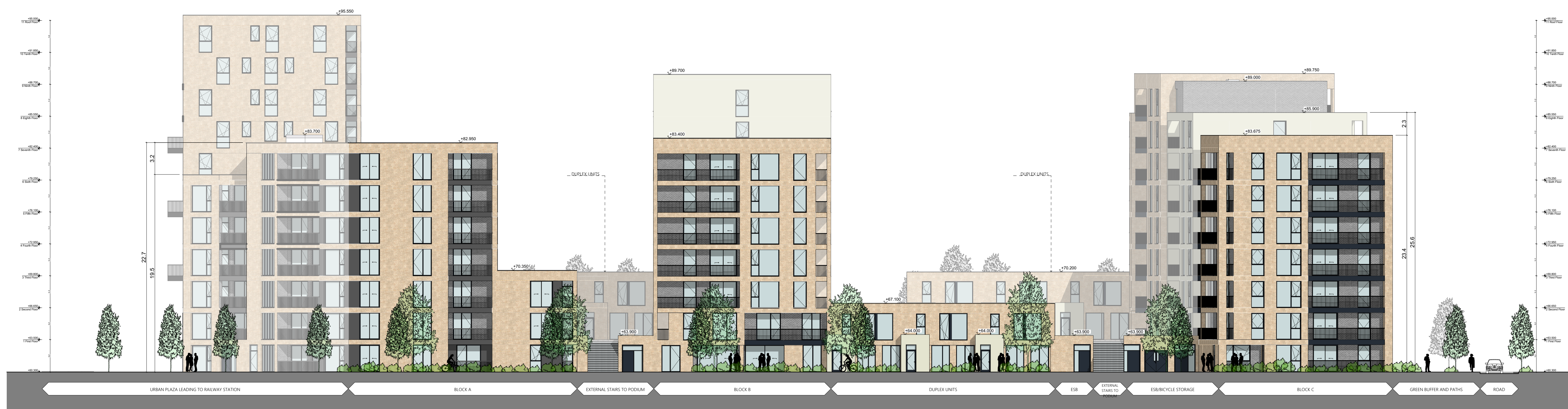
SOUTH ELEVATION SCALE 1:200