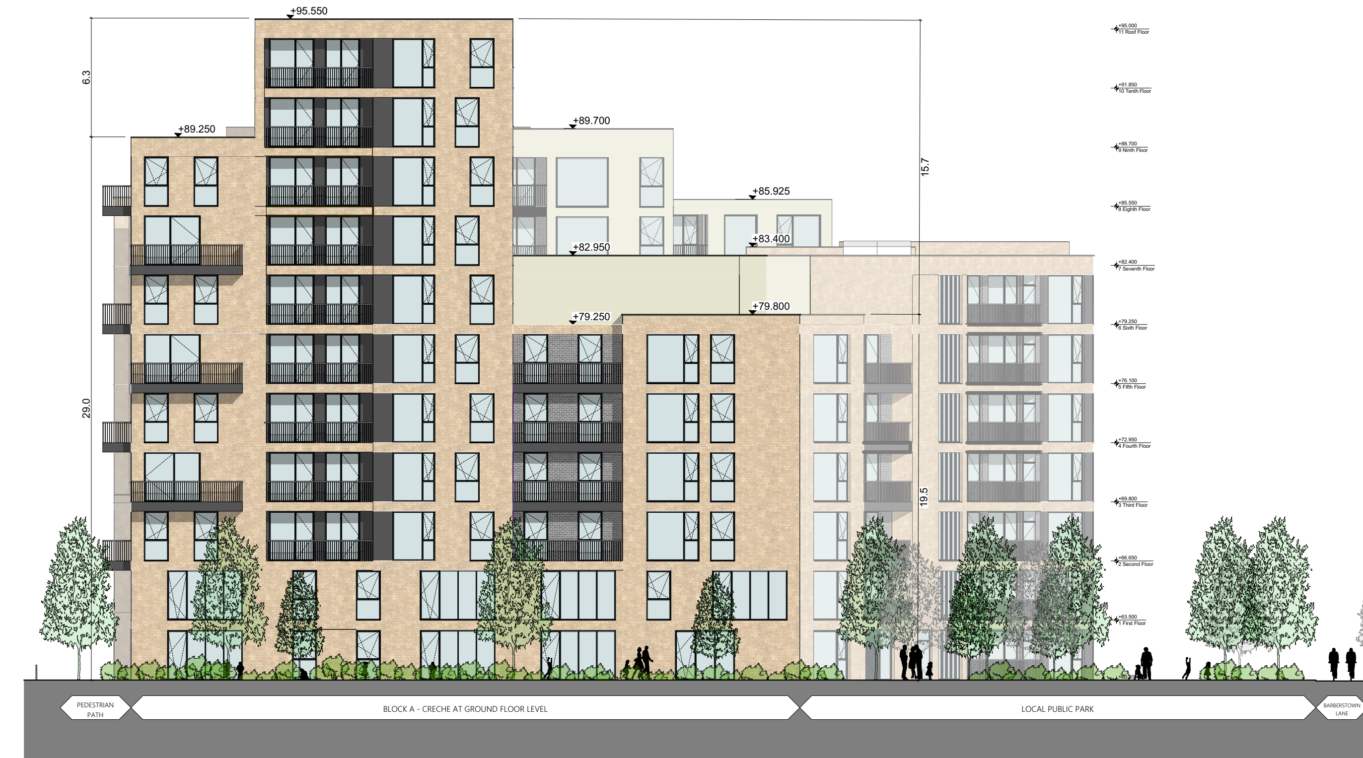
WEST ELEVATION SCALE 1:200