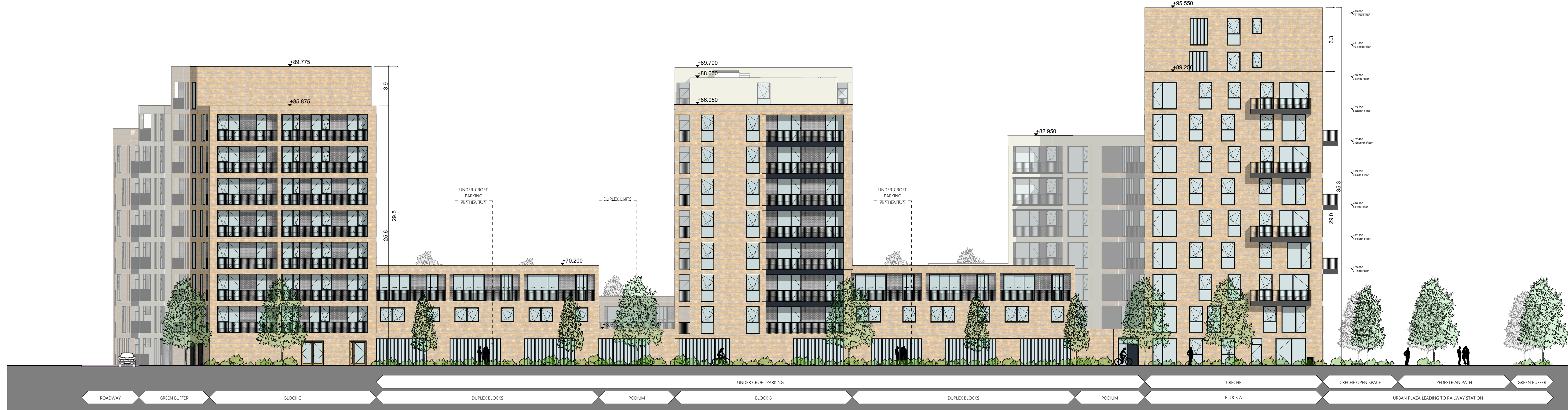
NORTH ELEVATION SCALE 1:200