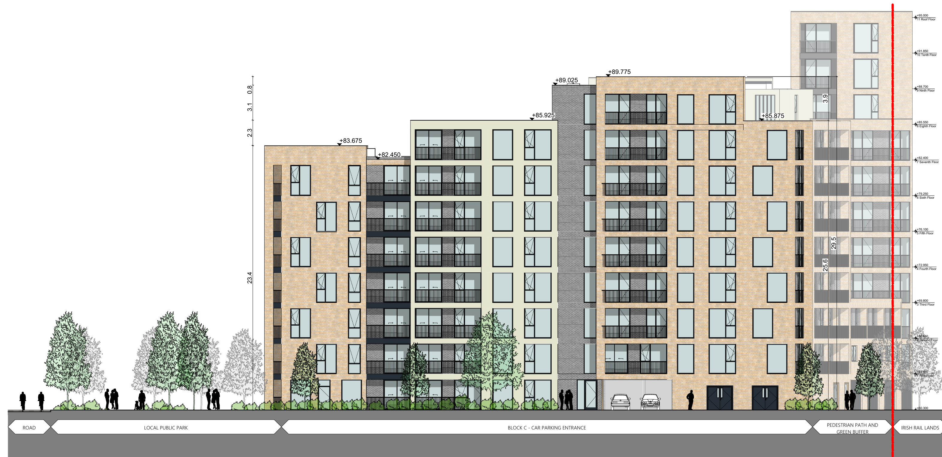
EAST ELEVATION SCALE 1:200